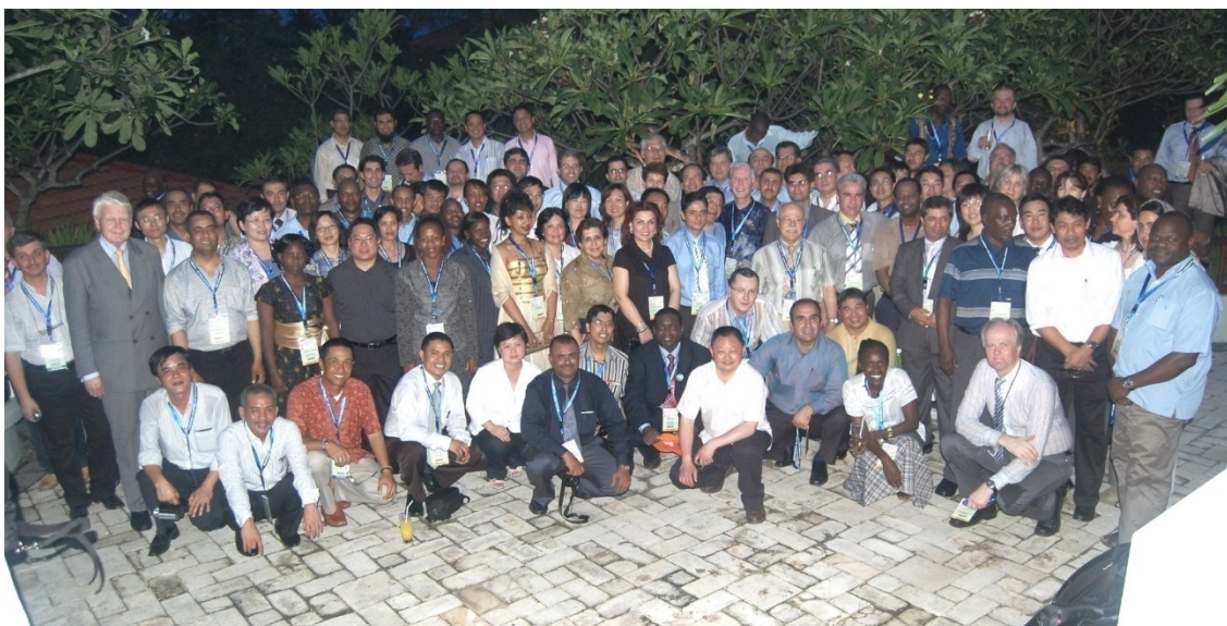
Figure 4: At the World Geothermal Congress in Bali, Indonesia in 2010, 114 former UNU Fellows attended. They are seen here with some of the staff and teachers at the UNU-GTP reunion organized in connection to the congress. A special guest of honour was the President of Iceland, Mr. Ólafur Ragnar Grímsson.