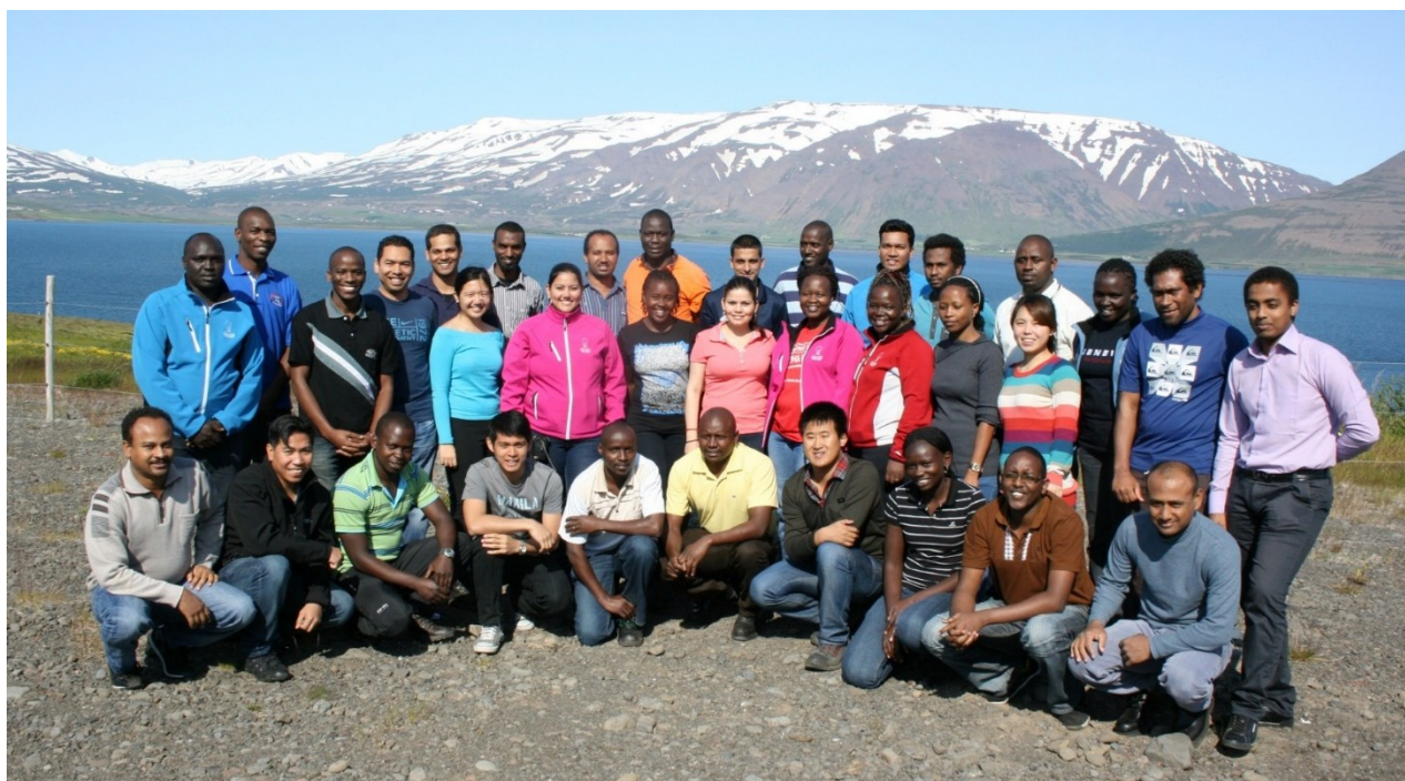
Figure 2: The 2013 group of UNU Fellows in Iceland – the largest group to date with 34 participants.

From Table 3, it can be seen that the leading recipient countries (Kenya, China, El Salvador, Philippines and Ethiopia) have sent professionals for specialized training in most of the courses offered. Relatively few experts have though been trained in Geological Exploration, Drilling Technology and Borehole Geophysics. The former two subjects are usually mastered in the home countries. However, a significant increase has been experienced in the need for training drilling engineers in the last 2-3 years, associated with the increased drilling efforts in some of the partner countries, especially Kenya.